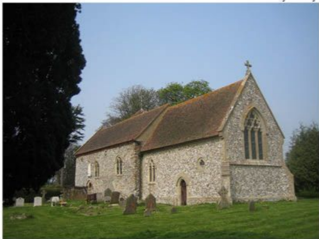
Nuffield Church of the Holy Trinity

largest stone circle in Europe. The path continues across the North Wessex Downs with a wild and remote landscape and fantastic views over the rolling hills down to the south. From Goring, on the River Thames, the landscape changes to woodland tracks with chalk grasslands. There are small villages and towns en route until Ivinghoe Beacon.